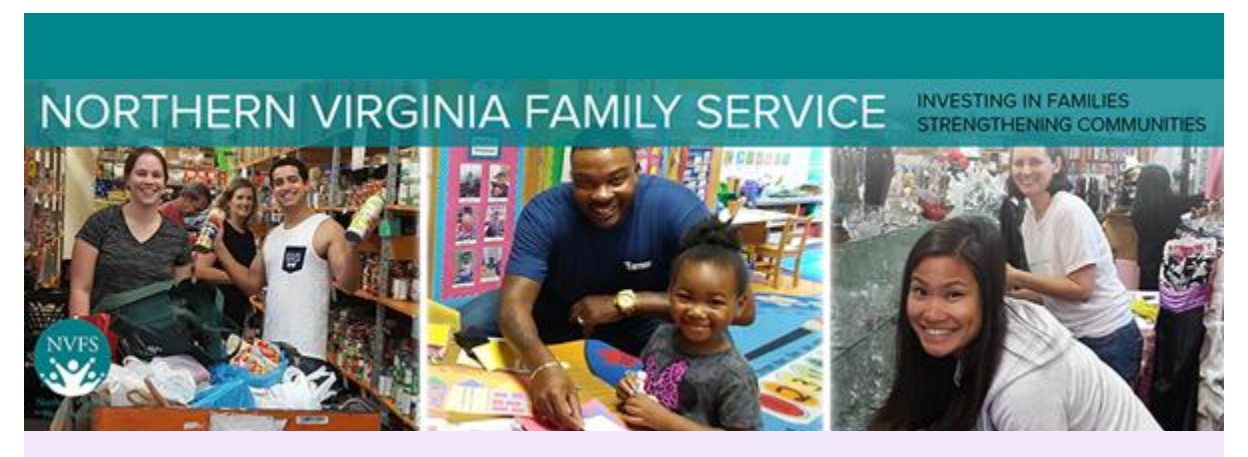
Follow us on social media!