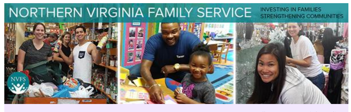
Follow us on social media!