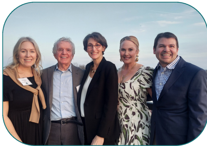
NVFS-SCAN Merger Reception at Above ALX, March 2025.

SCAN's services will continue within NVFS as the Child & Family Wellbeing programs, making an even greater impact. By combining SCAN's trusted prevention services with NVFS' comprehensive, wraparound service model, more local families will now have access to a deeper level of support to help them thrive in Northern Virginia. Thank you to all the donors and champions who made this new partnership possible!